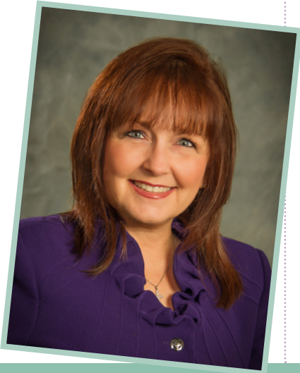
Mayor Belinda Constant