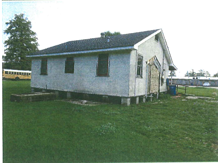
REAR VIEW 9/18/2014