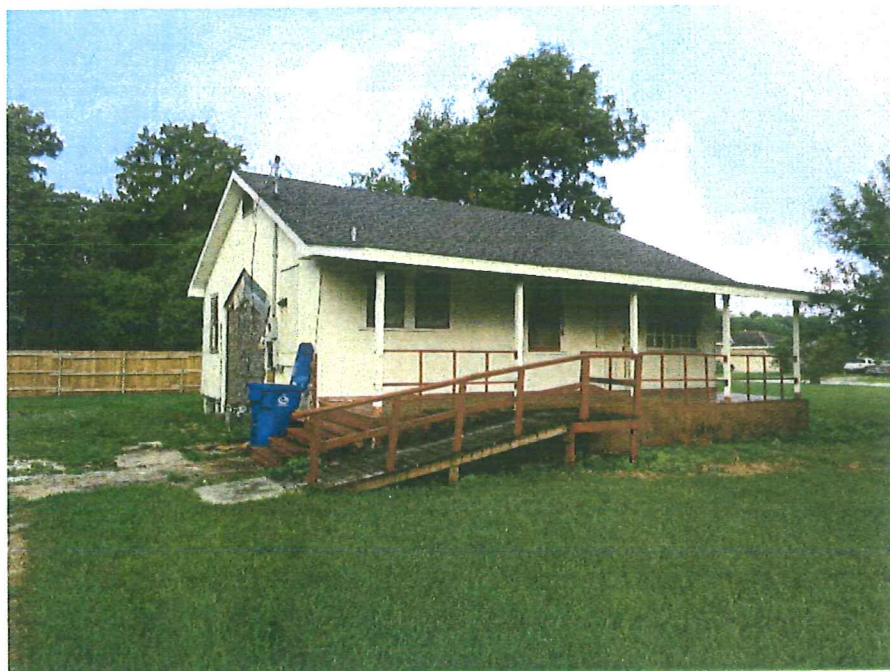
FRONT VIEW 9/18/2014

If using the Elevation Certificate to obtain NFIP flood insurance, affix at least 2 building photographs below according to the instructions for Item A6. Identify all photographs with date taken; "Front View" and "Rear View"; and, if required, "Right Side View" and "Left Side View." When applicable, photographs must show the foundation with representative examples of the flood openings or vents, as indicated in Section A8. If submitting more photographs than will fit on this page, use the Continuation Page.