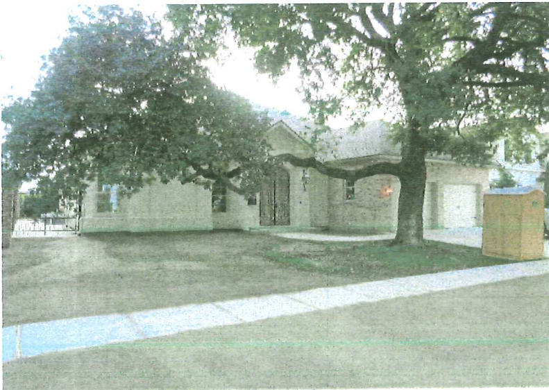
FRONT VIEW 7/29/2014

If using the Elevation Certificate to obtain NFIP flood insurance, affix at least 2 building photographs below according to the instructions for Item A6. Identify all photographs with date taken; "Front View" and "Rear View"; and, if required, "Right Side View" and "Left Side View." When applicable, photographs must show the foundation with representative examples of the flood openings or vents, as indicated in Section A8. If submitting more photographs than will fit on this page, use the Continuation Page.