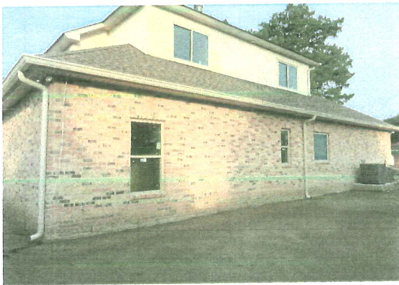
REAR VIEW 7/29/2014