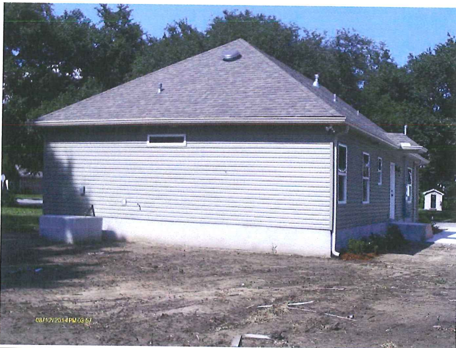
REAR VIEW 8/12/2014