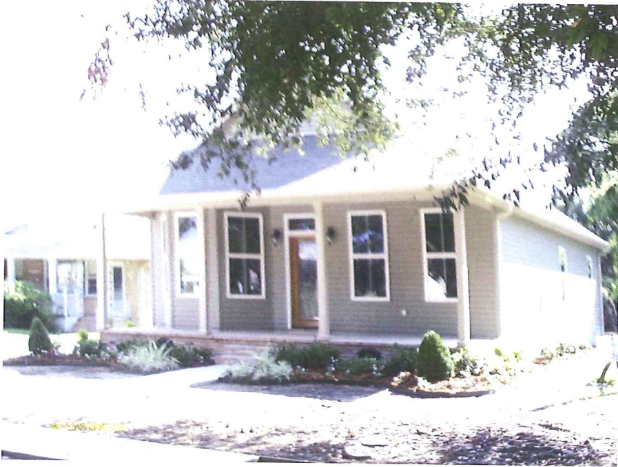
FRONT VIEW 8/12/2014

If using the Elevation Certificate to obtain NFIP flood insurance, affix at least 2 building photographs below according to the instructions for Item A6. Identify all photographs with date taken; "Front View" and "Rear View"; and, if required, "Right Side View" and "Left Side View." When applicable, photographs must show the foundation with representative examples of the flood openings or vents, as indicated in Section A8. If submitting more photographs than will fit on this page, use the Continuation Page.