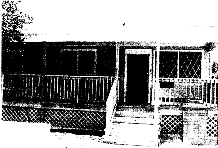
05-04-2008 "Front View"